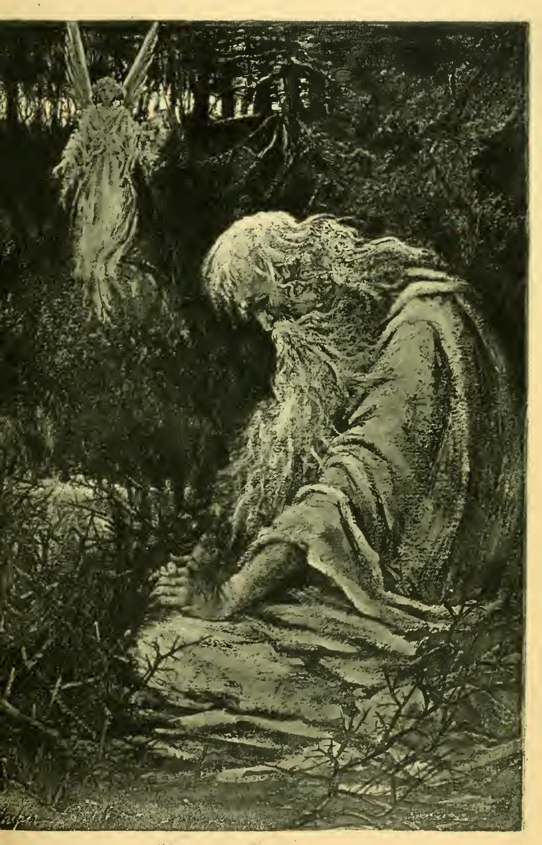
He rought the seven